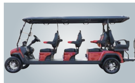
RANGER 6+2 PLUS