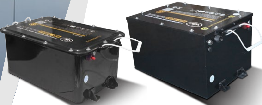
MODEL: 48V 105Ah