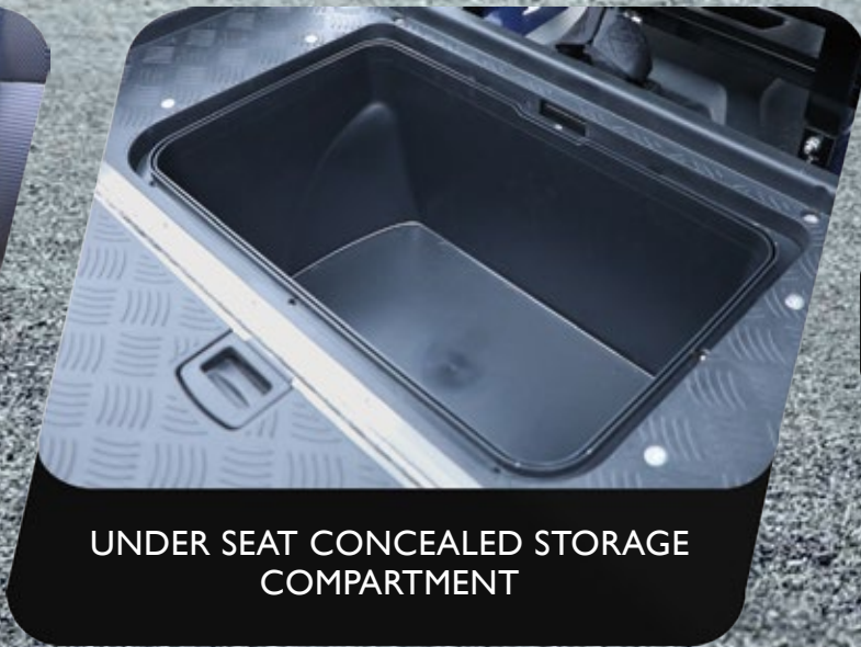
UNDER SEAT CONCEALED STORAGE COMPARTMENT