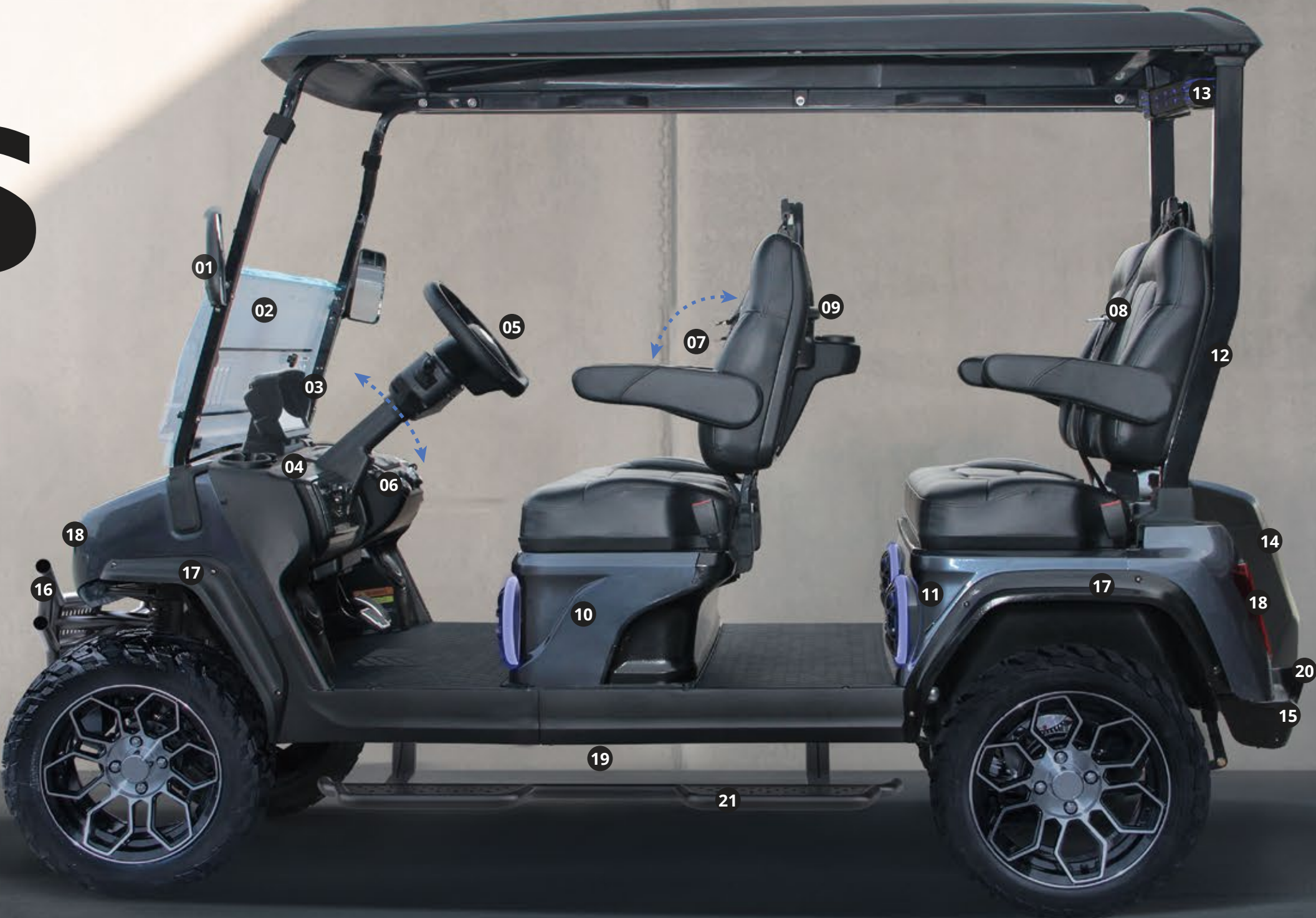
“MAVERICK” MODEL SHOWN