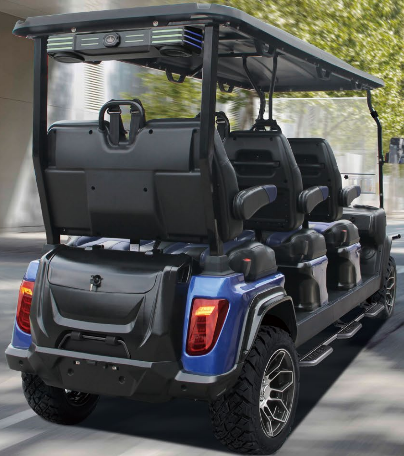
“MAVERICK” MODEL SHOWN