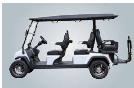
RANGER 4+2 PLUS