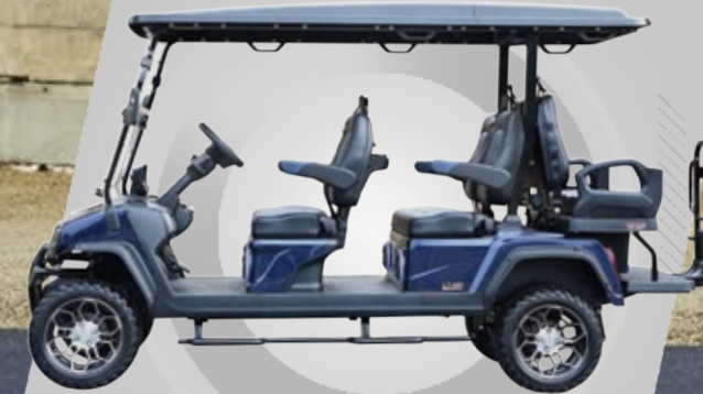
MAVERICK 4+2 PLUS