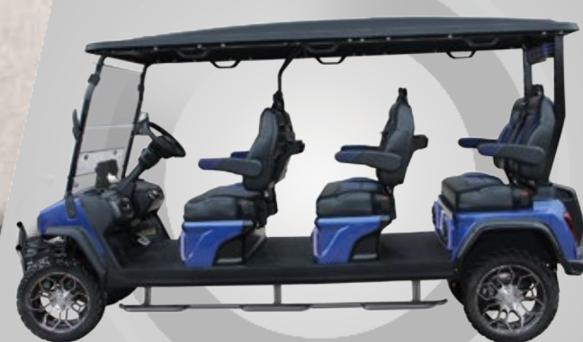
MAVERICK 6 PLUS