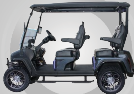
MAVERICK 4 PLUS