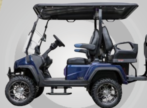
MAVERICK 2+2 PLUS