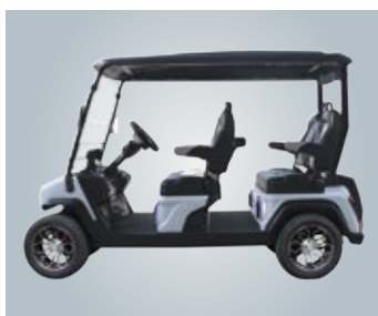
RANGER 4 PLUS