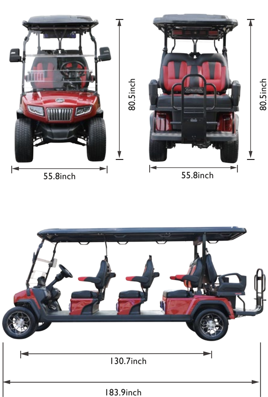
D5-RANGER 6+2 PLUS