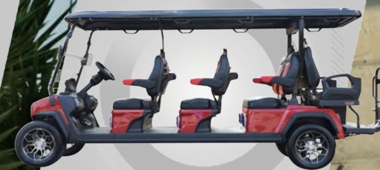
RANGER 6+2 PLUS