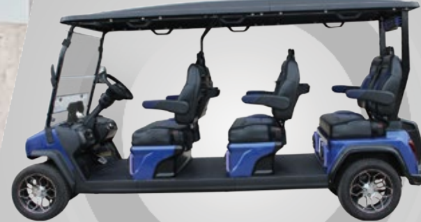
RANGER 6 PLUS