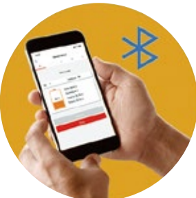
MOBILE & PC LIVE MONITOR APP