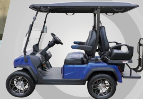
RANGER 2+2 PLUS