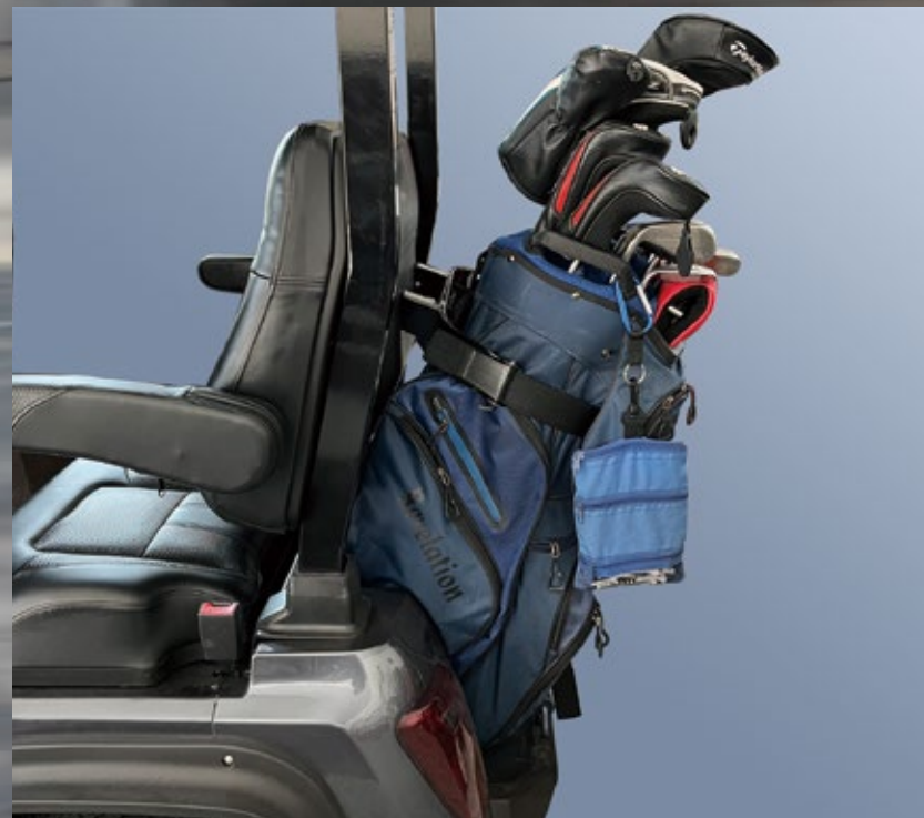
OPTIONAL GOLF BAG HOLDER