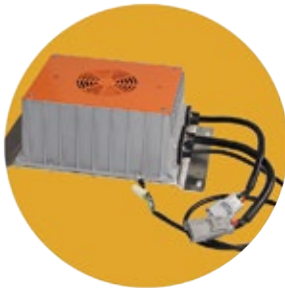
25A ADAPTIVE ON-BOARD CHARGER