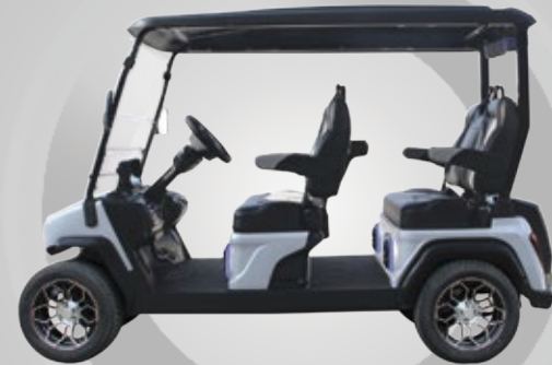
RANGER 4 PLUS