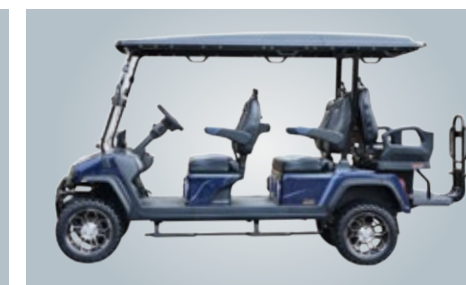
MAVERICK 4+2 PLUS