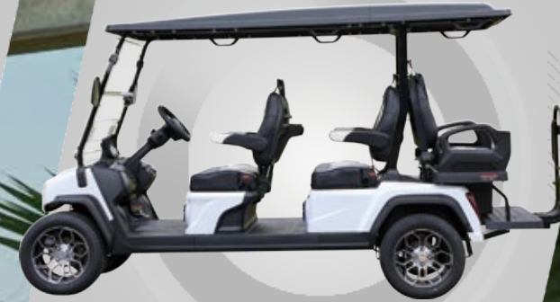
RANGER 4+2 PLUS