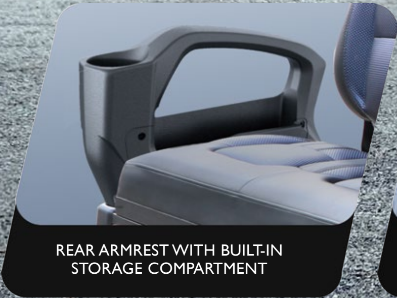
REAR ARMREST WITH BUILT-IN STORAGE COMPARTMENT

Rear Handrail with Footrest: Enhanced Stability and Comfort with a Built-In Footrest, Providing Extra Support and Relaxation.