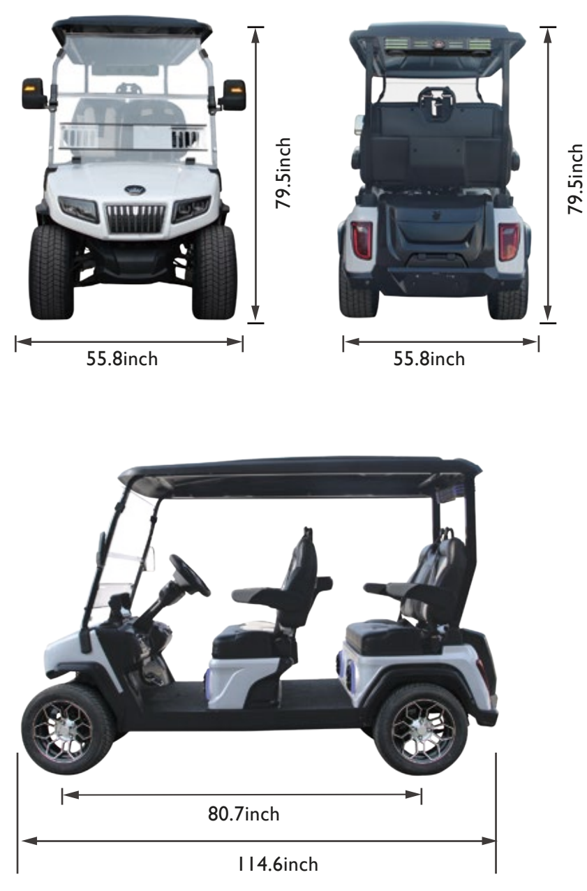
D5-RANGER 4 PLUS