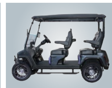
MAVERICK 4 PLUS