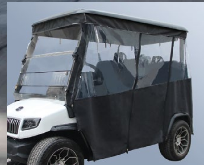
OPTIONAL ALL-WEATHER ENCLOSURE

*Glove boxes and rear storage compartment use common keys for all locks