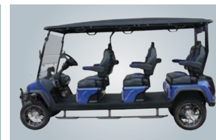
MAVERICK 6 PLUS