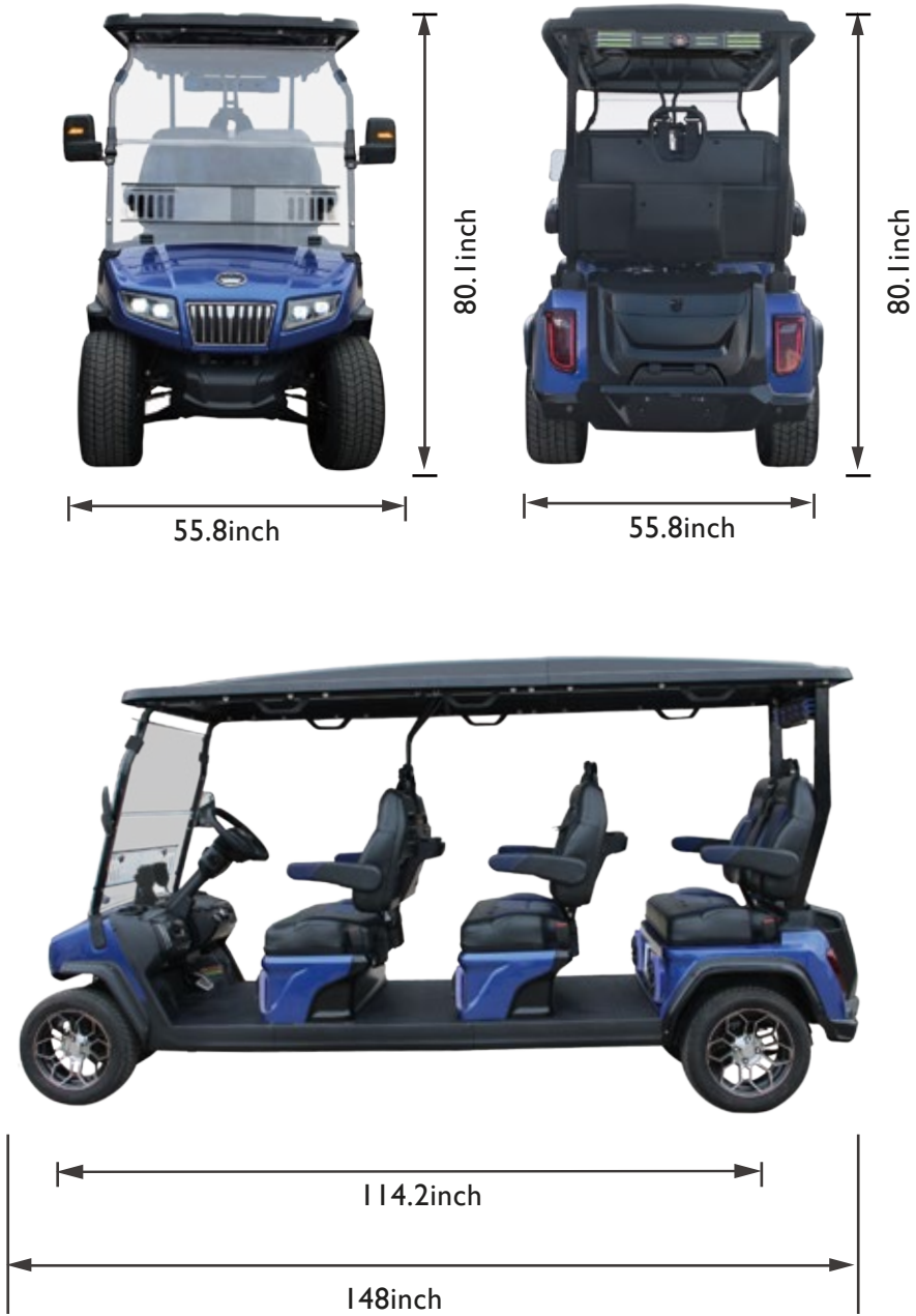
D5-RANGER 6 PLUS