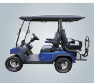
RANGER 2+2 PLUS

14X7"ALUMINUM WHEEL/ 23X10-14 SILENT TIRE WITH OFF-ROAD THREAD