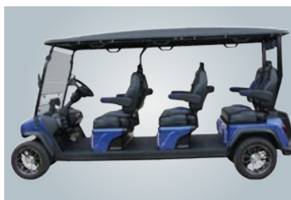
RANGER 6 PLUS