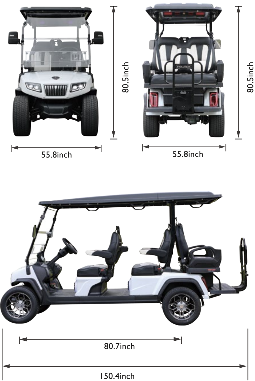
D5-RANGER 4+2 PLUS