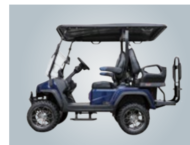
MAVERICK 2+2 PLUS